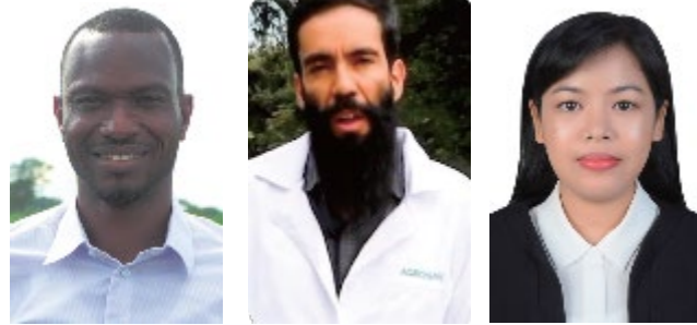
Awardees for Japan Award 2024