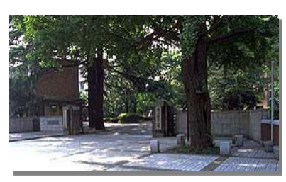
Tokyo NODAI with 125 years history is honored to welcome AAACU member-institutions!